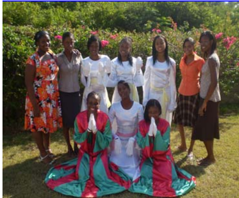
Members of the Salem Baptist youth group

In this activity, the members are divided into two groups and questions are posed by a team at each turn, for their opponents to answer correctly. As the name suggests, water is involved. If the opponents answer incorrectly they are then chased and soaked (in the church yard of course) with water balloons!