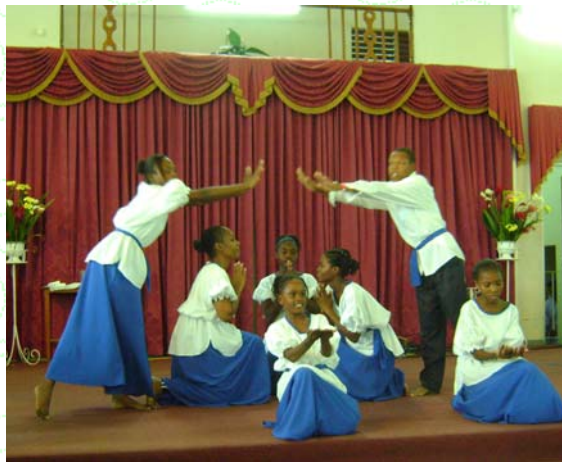
Zone 4's Dance entry for Youth Rally 2008

It is that time again when Baptist youth from across Jamaica, gather for the weekend of a lifetime. And guess what? You are specially invited.