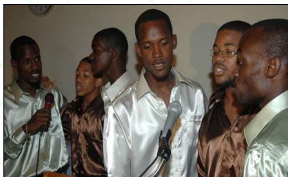
6PM

Members of the group also encourage young people to use the gifts that God has blessed them with for His Glory. As for the future, 6PM plans to record an album, and hopes to start the process soon.