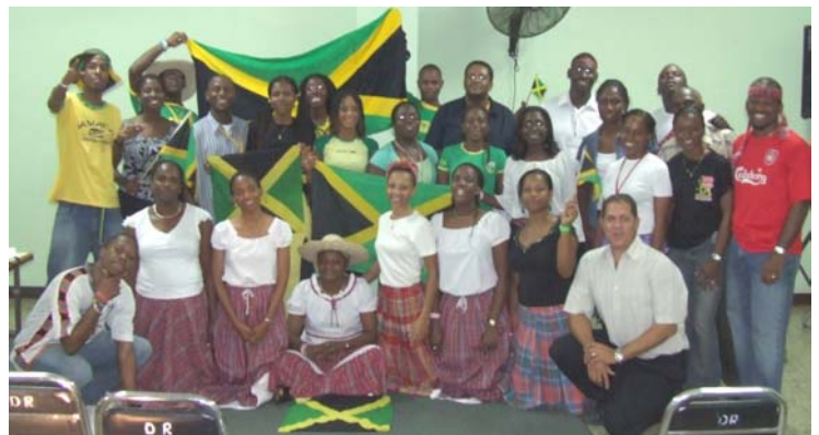
Members of the Jamaican Delegation